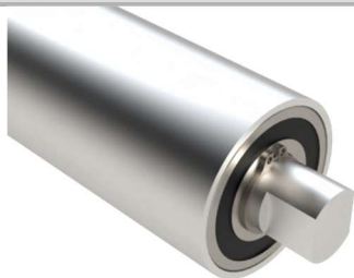
Fixed (External Circlips)

Most Popular Axle Finish Options ask a member of the AED team for more options